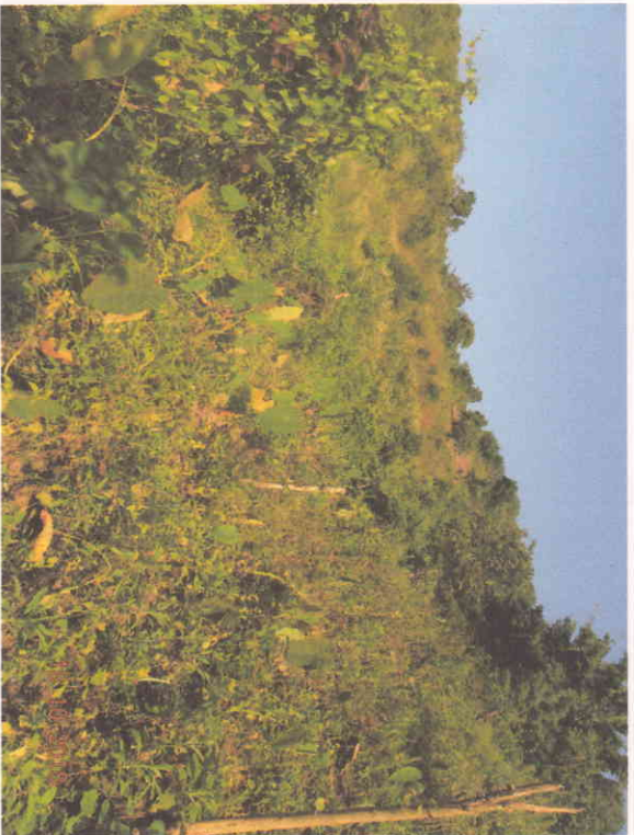
TOWARD THE NORTH