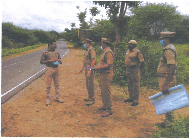
Inspected with Staffs of the Hogenakkal and Pennagaram Range of Dharmapuri Division

Inspected the area proposed for diversion of 0.792 Ha of Forest Land in Pennagaram RF (0.372 Ha) and Woddapatty RF (Part) (0.105 Ha) in Hogenakkal Range of Dharmapuri Forest Division and Biligundulu RF (0.210Ha) and Woddapatty RF (Part) (0.105Ha) in Anchetty Range of Hosur Division on 02-11-2021 along with the staffs of the Hogenakkaland PennagaramRange of Dharmapuri Forest Division and Anchetty Range of Hosur Forest Division.