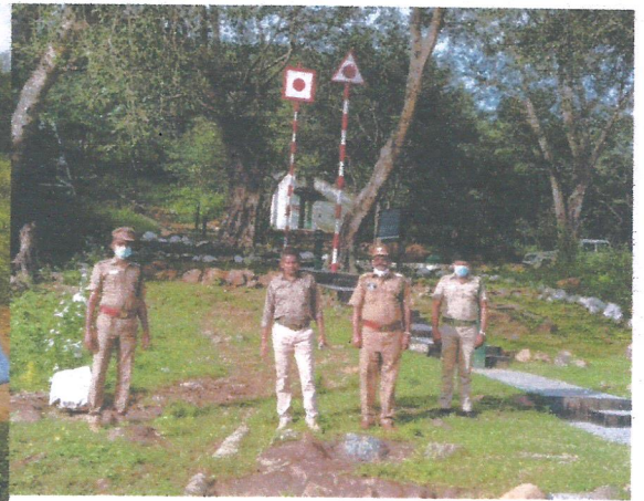
Inspected with Staffs of the Anchetty of Hosur Division

The proposed site for laying of underground Optical Fibre Cable for improving communication networking 4G facility lies along the stretches of Dharmapuri to Anchetty route of Hogenakkal stretch which is passing through the Pennagaram RF, Woddapatty RF(Part) in Dharmapuri Forest Division and Biligundulu RF, Woddapatty RF(Part) in Wildlife Division , Hosur.