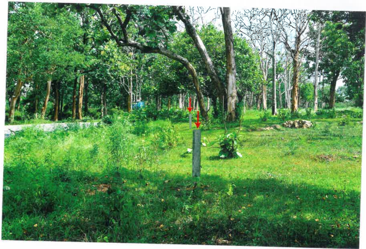
Grudalur - TN Border O' Land mark