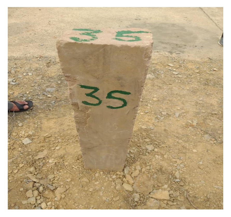
Pillar at site

4. Total cost of the project at present rates is reported to be 135000 Lacs.