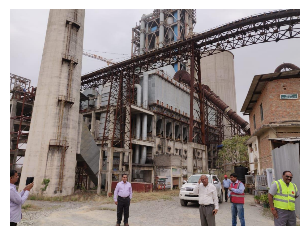
JP Super Cement Plant at site