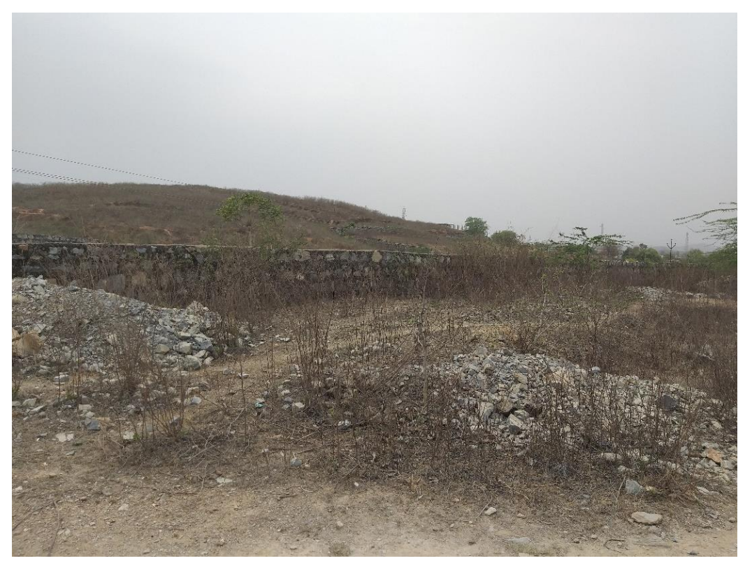
A view of proposed area for diversion