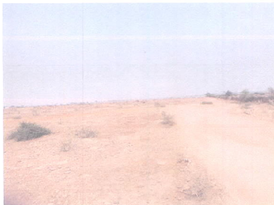
Pathway Passing through the Proposed Land

Whether the land under diversion forms part of any unique eco-system. No