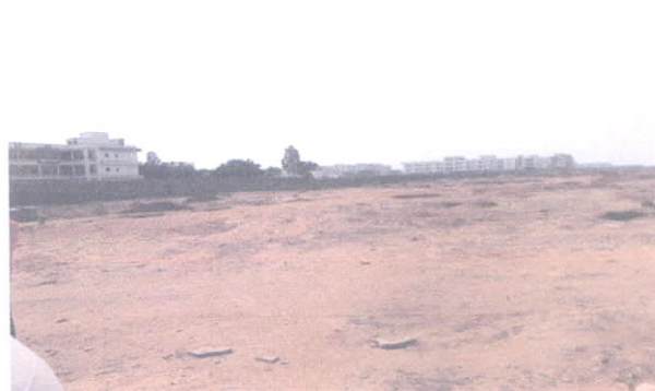
(View of the proposed Forest land to be diverted)

Total number of trees to be felled.- NIL