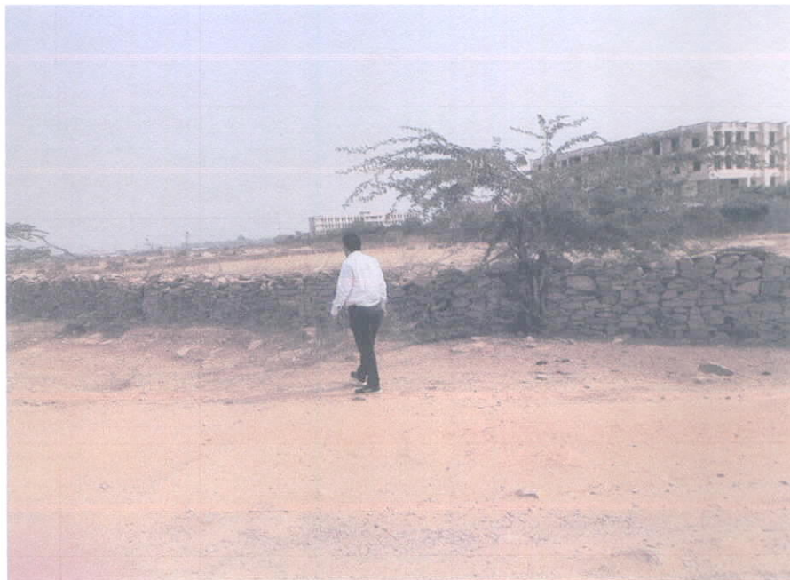
(A stone wall demarcating land put to agriculture use for raising crops)

After relocation of all 16 villages from the critical / Tiger habitat (CTH) area about 1268 ha. of land (601 ha in case of relocation of two villages namely Girdhapura and Damodarpura) would be rendered for Tiger/wild life conservation purpose. The area so vacated shall develop into forest in continuity to the CTH which shall facilitate Tiger reintroduction. The Villagers relocated under the project shall also be benefited by Rehabilitation Packages proposed under the Scheme.