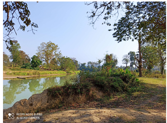
(i)Photo showing the Namchik River and proposed area in Namphai RF.