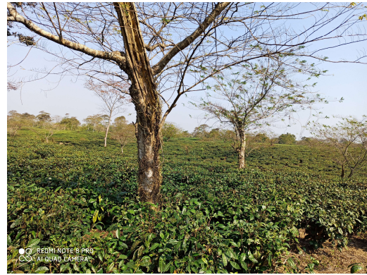
(i)Photo showing the encroach tea garden.