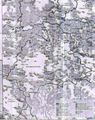
FOREST TYPE MAP (As per Champion & Seth's Classification-1958)

(Handwritten Signature) A.G.M. (CM) 3/o The T.D.M. BSNL Ambikanur - 497001