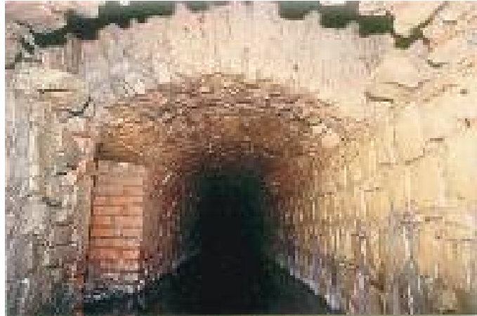
Table 24: Summary of the storm water drainage system

The SWD system of Mumbai comprises a hierarchical network of roadside surface drains (about 2,000 km mainly in the suburbs), underground drains and laterals (about 440 km in the island city area), major and minor nallahs (200 km and 87 km respectively) and 186 outfalls, which discharge all the surface runoff into rivers and the Arabian Sea.