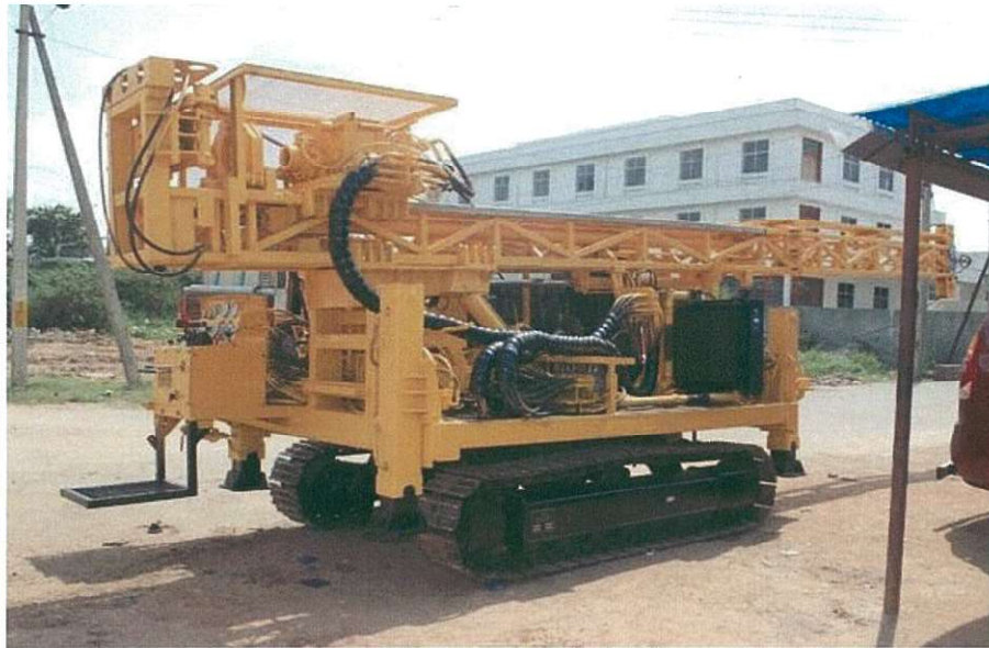
Figure: 1- Proposed drill machine