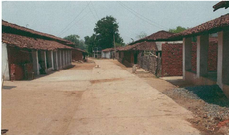
Figure: 2.1- Existing village path in Baghmara village