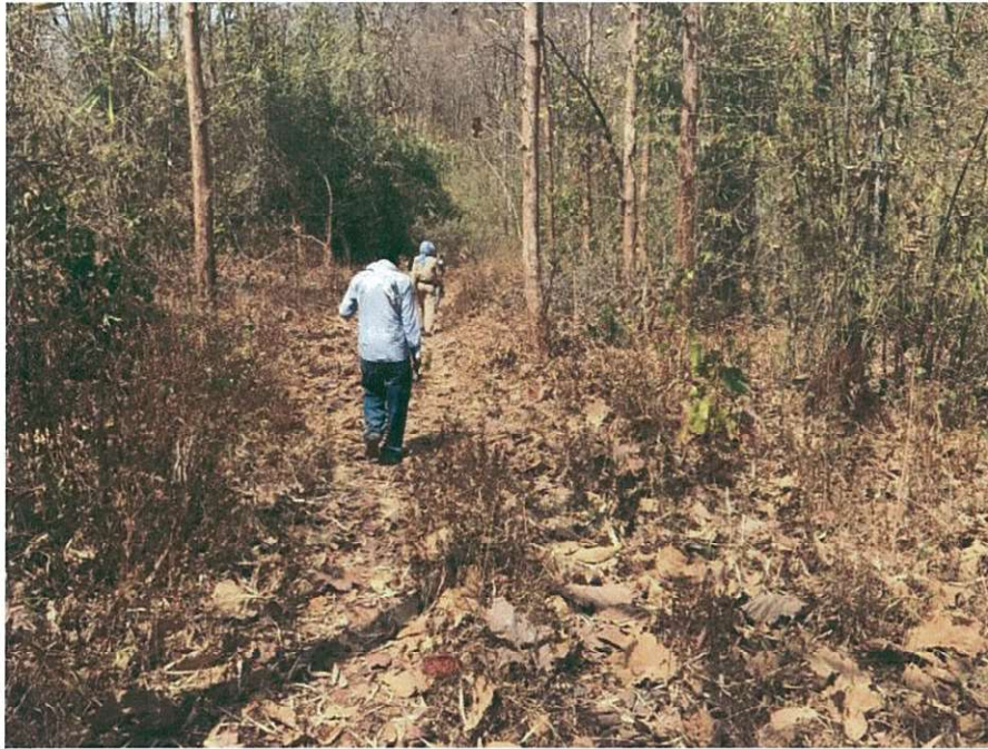
Figure: 2.2- Existing access path to prospecting site