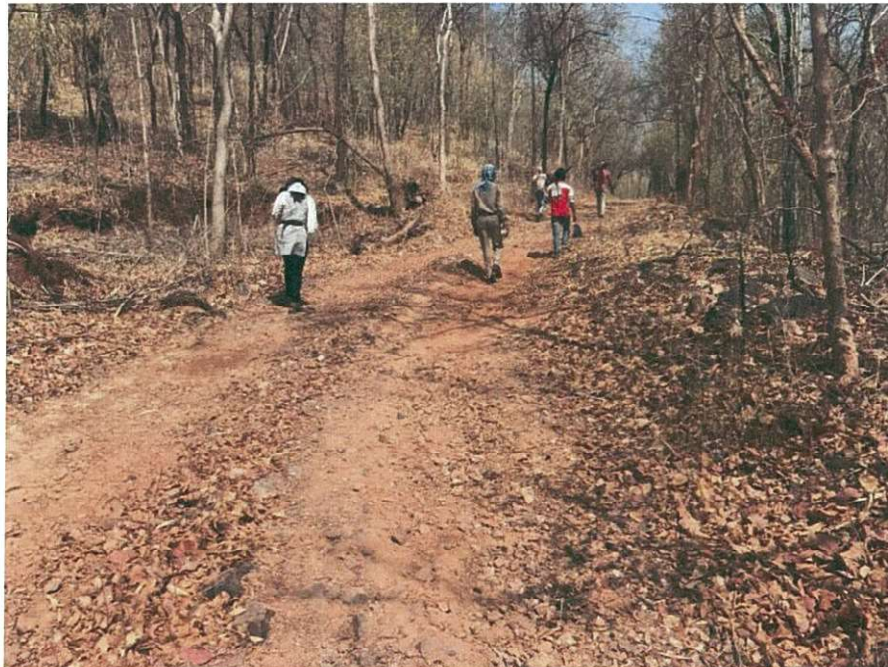
Figure: 2.3- Existing forest tracks